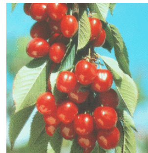
Early Burlat Cherry

You can see a list of what container fruits are available on our website at: