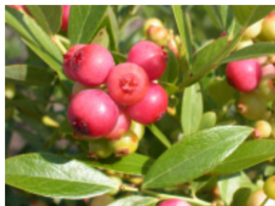
Pink Lemonade blueberry