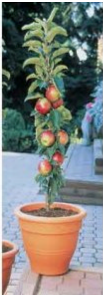
Scarlet Sentinel columnar Apple