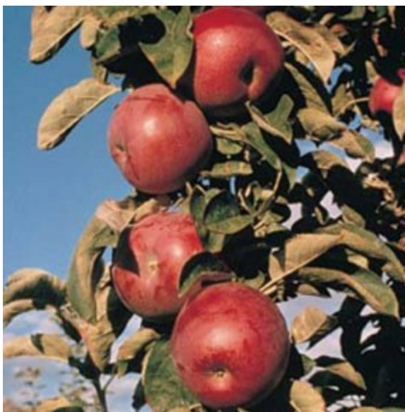
Northpole Columnar apple

Blueberries require two different varieties for cross-pollination. After many years a full-size blueberry bush will be about six feet tall and wide. (They can be kept smaller with pruning.) Here's a trick if you don't have room for two bushes-plant two different varieties of one- or two-gallon blueberry plants in one hole. The combined adult plant will be little larger than a single plant (due to competition for light and nutrients) and pollination will occur between the two "halves". Plant an early ripening variety with a mid- or late- ripening variety and you can enjoy fresh berries from mid-July through late September. Besides the flowers and fruit, blueberries add bright red fall color to your landscape.