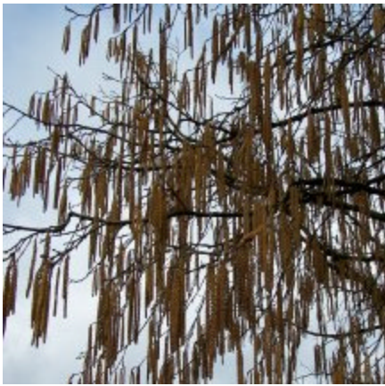
Winter catkins on Filberts