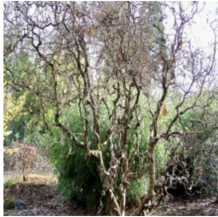
Harry Lauder's Walking Stick

Grapes make ornamental trellis plants as well as providing fruit. They can also be trained along a fence. Grapes are self-fruitful so only one plant is required to get fruit. Some exciting new seedless table grapes are currently undergoing field trials at the WSU Field Station near Mt Vernon, WA. They were developed by University of Arkansas and are named after planets ("Jupiter", "Mars", "Venus", etc.) "Canadice" is also a good seedless grape for our climate.